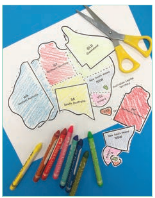
Adult supervision is essential. Involve and talk with your child as much as possible.